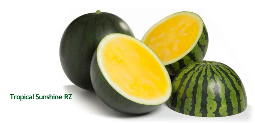
Seedless varieties with colour diversification Different and attractive skin types are also included in this concept