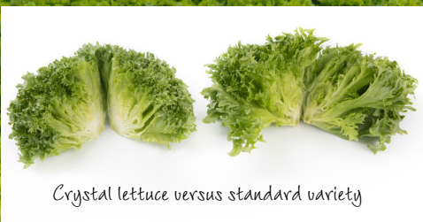
Crystal lettuce versus standard variety