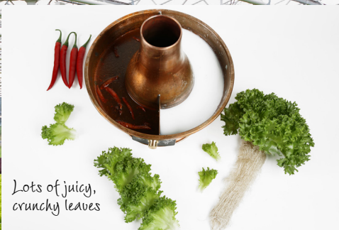
Lots of juicy, crunchy leaves